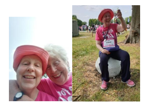
So, a big thank you to you all

Why put myself through this? As most of you know I had Stage 3 breast cancer diagnosed in 2023 and it's only because of the medical advancements that I am still here. So, I decided when I was well enough, I would fund raise for Cancer Research UK. With the very generous support from my friends at St Michaels, I have raised £1185.