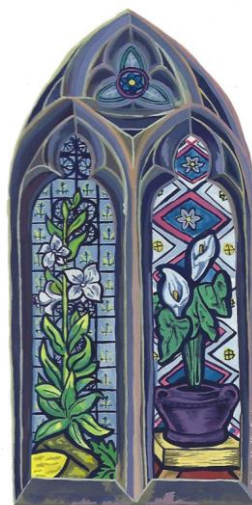
The Friends of St. Michael's Bray

Alternatively, we have some simple greetings cards & envelopes using the same design – price £1 each.